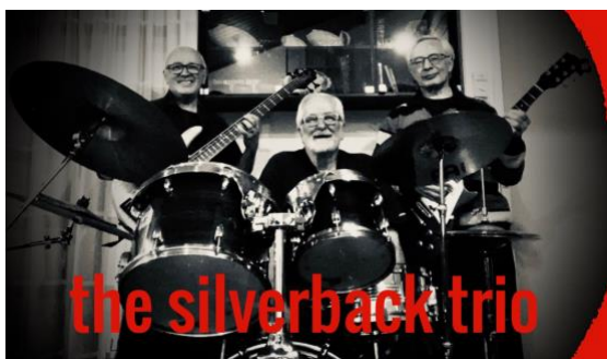
The Silverback Trio