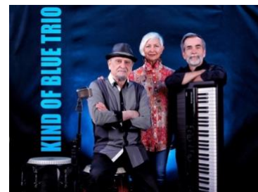
Kind of Blue Trio