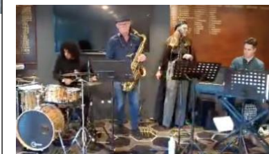
Sala's Jazz Salad