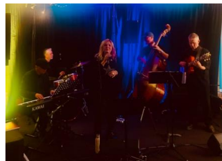
The Jane Little Quinte