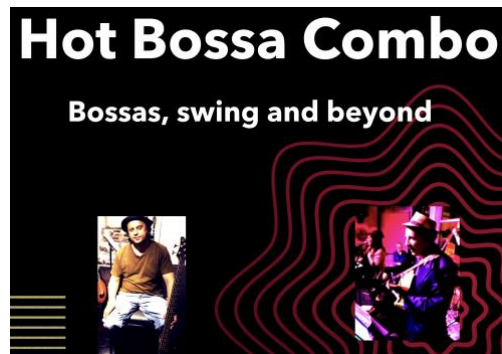
Hot Bossa Combo