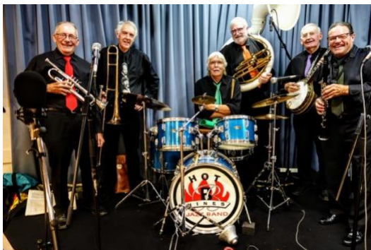
Hot 'B' Hines Jazz Band