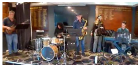
Sala's Jazz Salad.