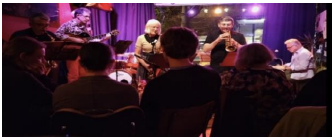
Hot Cross Seven