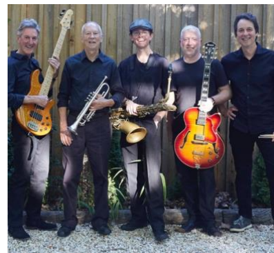
Hot Five Jazz Band